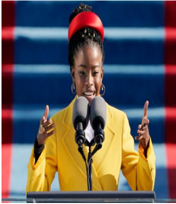
Amanda Gorman, American Poet, and activist

Accolades do not begin to describe the true beauty and essence of our nation's first National Youth Poet Laureate and founder of the nonprofit organization One Pen One Page, a youth writing and leadership program. Imagine diagnoses of a speech impediment, auditory processing disorder, and hypersensitivity to sound while a young girl during early development. Now, imagine overcoming all these challenges to become an American poet and activist, focusing on issues related to race, marginalization, feminism, and oppression.