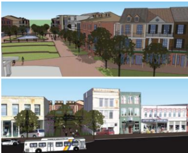
Proposed LCI Downtown Improvements

A strong downtown Central Business District (CBD) can be a sense of place for residents, merchants, artists, tourists, and students. This is beneficial to both our residents and visitors as the downtown CBD becomes more of a destination and source of pride. For the city of Fairburn, the historic downtown area is one of the city’s greatest assets. From the local merchants, to the restaurants and even chain establishments, the downtown Fairburn area was once a thriving destination for the surrounding community. Recent initiatives intend on making the area a focal point once again. The city’s Main Street Affiliate level designation, along with the new Main Street Program Manager, will work in concert with the local merchants and businesses in the downtown