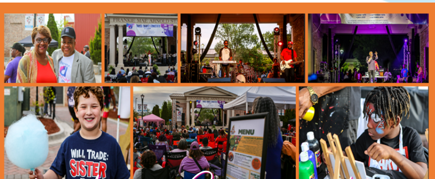
Fairburn Summer Pics