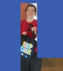
OZ PIZZA 5 W BROAD ST FAIRBURN, GA 30213