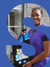
HAIRLOOMS 27 W CAMPBELLTON ST FAIRBURN, GA 30213

Send all completed applications to Chapin Scott – Cscott@fairburn.com