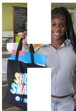
HIKARI BOTANICAL CAFE 216 NW BROAD ST UNIT B FAIRBURN, GA 30213