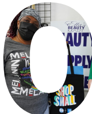
ELLAS BEAUTY MART 216 NW BROAD ST UNIT B FAIRBURN, GA 30213