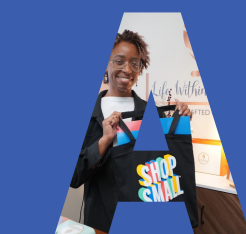
LIFE WITHIN CANDLES 27 W CAMPBELLTON ST FAIRBURN, GA 30213