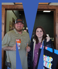
CREST JEWELERS 99 SW BROAD ST FAIRBURN, GA 30213