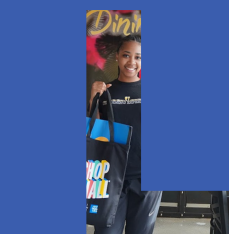
DINING EXPERIENCE 8420 SENOIA RD FAIRBURN, GA 30213