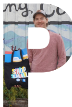
COCHRAN MILL BREWING CO. 27 WORD ST FAIRBURN, GA 30213