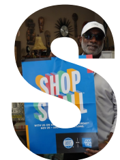
TIMELESS TREASURES 15 SMITH ST FAIRBURN, GA 30213