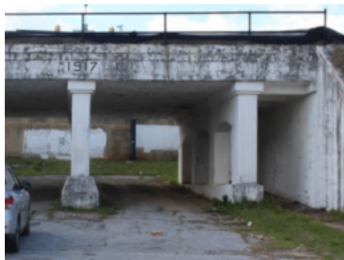
Redeveloped underpass along SE Broad Street.