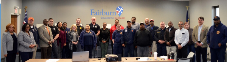
The City of Fairburn is "Situated to Succeed" The Human Resources Department continues to provide training for staff members to "Move Forward Together!"